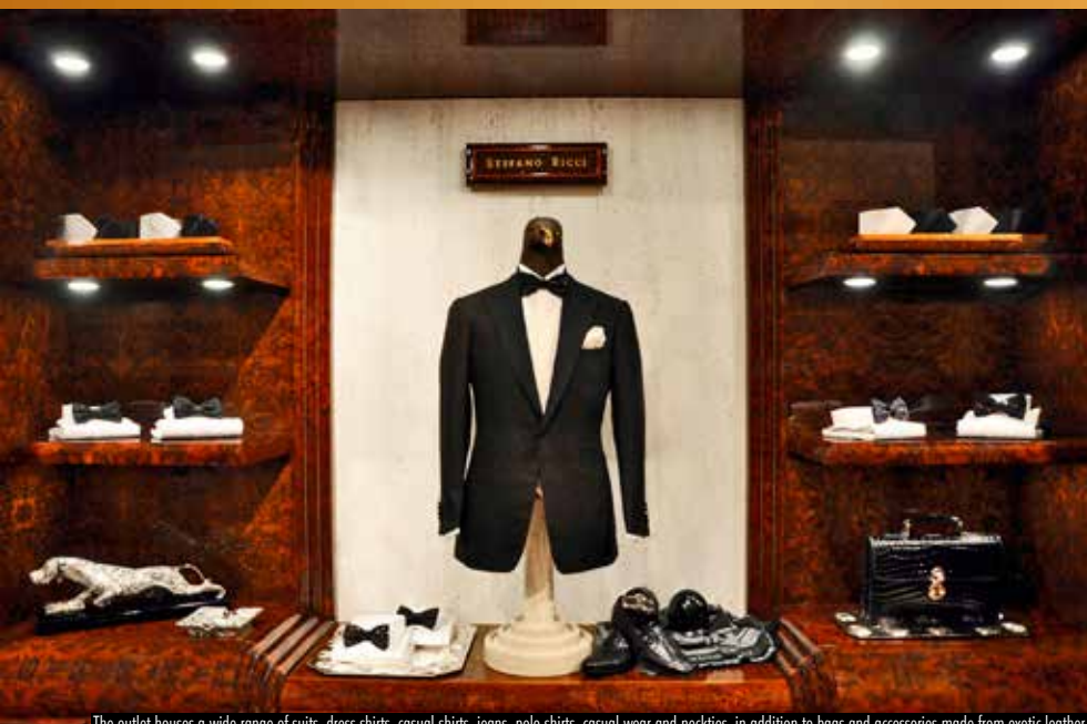
The outlet houses a wide range of suits, dress shirts, casual shirts, jeans, polo shirts, casual wear and neckties, in addition to bags and accessories made from exotic leather.