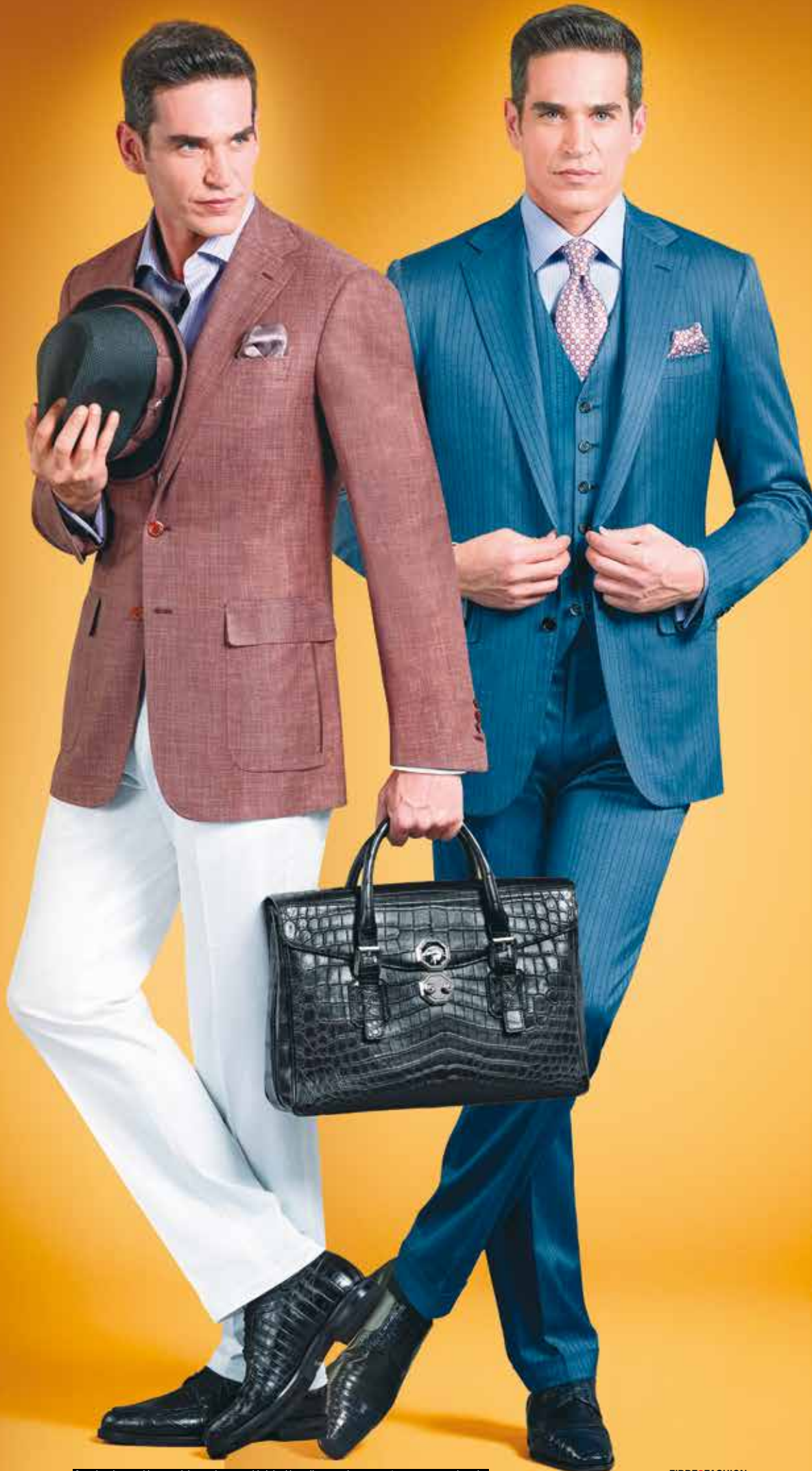
Croc-skin shoes and bags, and diamond-encrusted belt buckles still remain the company's ostentatious trademarks.